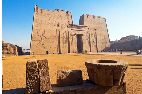
Temple of Edfu

After breakfast you will be led to the Temple of Edfu . Welcome to one of the best preserved shrines in Egypt. The inscriptions on the walls portray important information on myth, language and religion during the Hellenistic period. Famous for also being the second largest temple in Egypt, this place is also known as the Temple of Horus (the falcon headed deity).