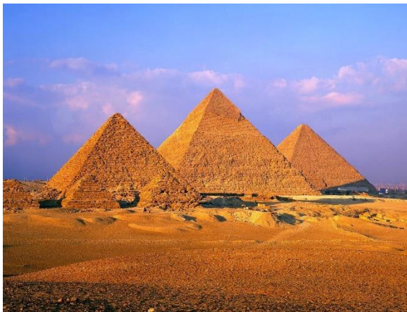
Giza Pyramids Complex

Enjoy breakfast in the comfort of your hotel, your morning private tour will include Giza Pyramids Area, Outlook Pyramids, Solar Boat, Sphinx and Valley Temple.