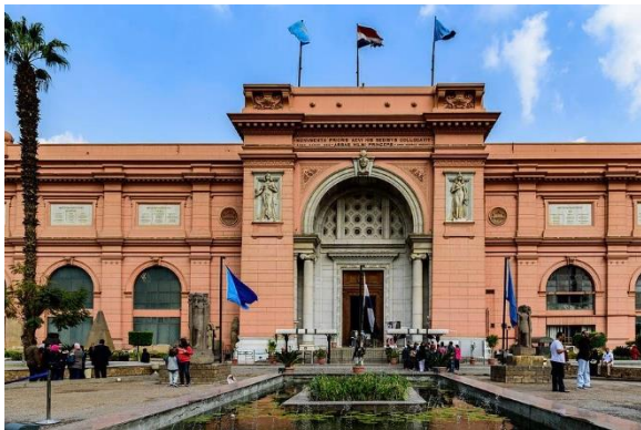
Museum of Egyptian Antiquities

Hotel breakfast, airport transfer, depart Abu Simbel (ABS), arrive Cairo (CAI), visit Egyptian Museum and Royal Mummy Room.