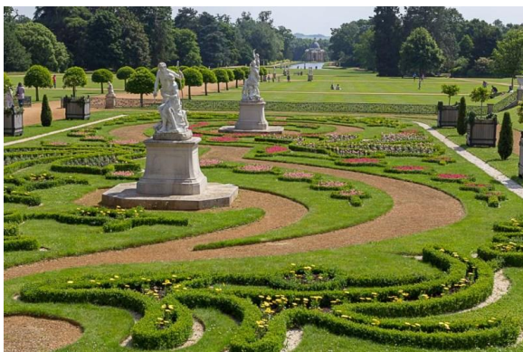
Kitchener's Botanical Gardens

Breakfast on board, highlights include the Temple of ISIS, Unfinished Obelisk, Felucca Ride, Kitchener's Botanical Gardens and Agha Khan Mausoleum (outlook).